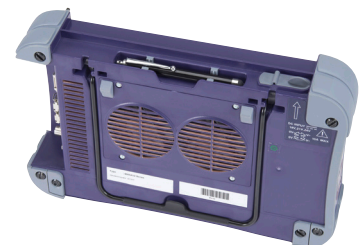
E6300 transport and fiber module carrier