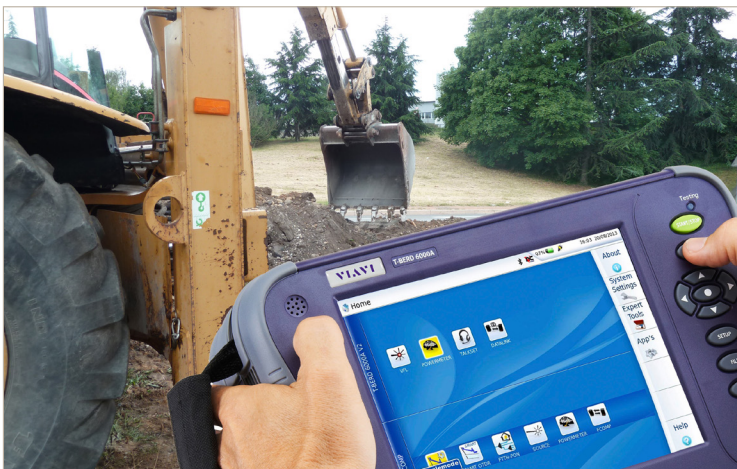
Portable and upgradeable platform with interchangeable test modules increases technician productivity

The flexibility of interchangeable module carriers and various plug-in modules let users create a platform that meets today's specific testing needs and yet it can evolve seamlessly to meet tomorrow's ever-changing network requirements.