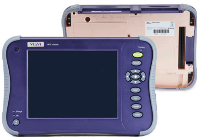
Back of the module carrier where other modules are attached

The multidimensional design of the T-BERD/MTS-6000A (V2) provides optimal configuration flexibility with extended battery life. The E6100 module carrier is best suited for fiber applications; whereas, the high-powered battery in the E6200 module carrier extends battery life when used with the carrier Ethernet (MSAM) or other intensive fiber applications.