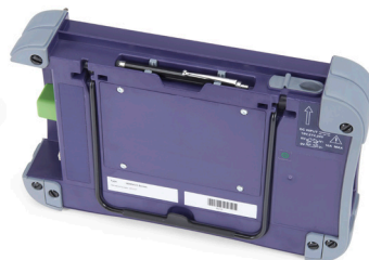
E6100 fiber module carrier